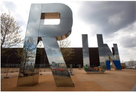
Sculpture in Olympic Park in London, 2012