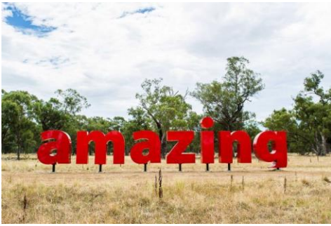
Sculpture on the Lachlan Sculpture trail .